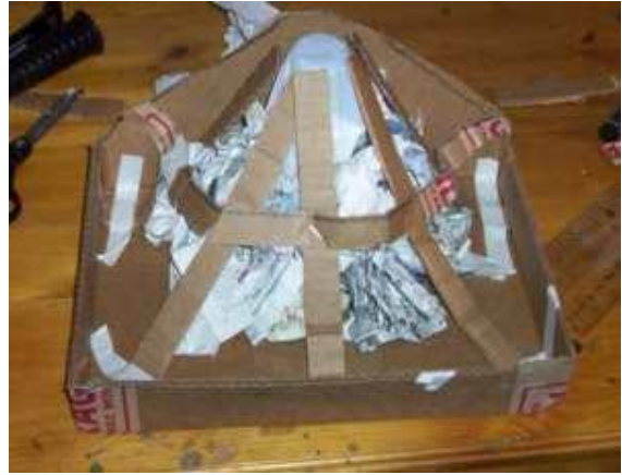
Making a base for a pyramid with recycled card, masking tape and foil