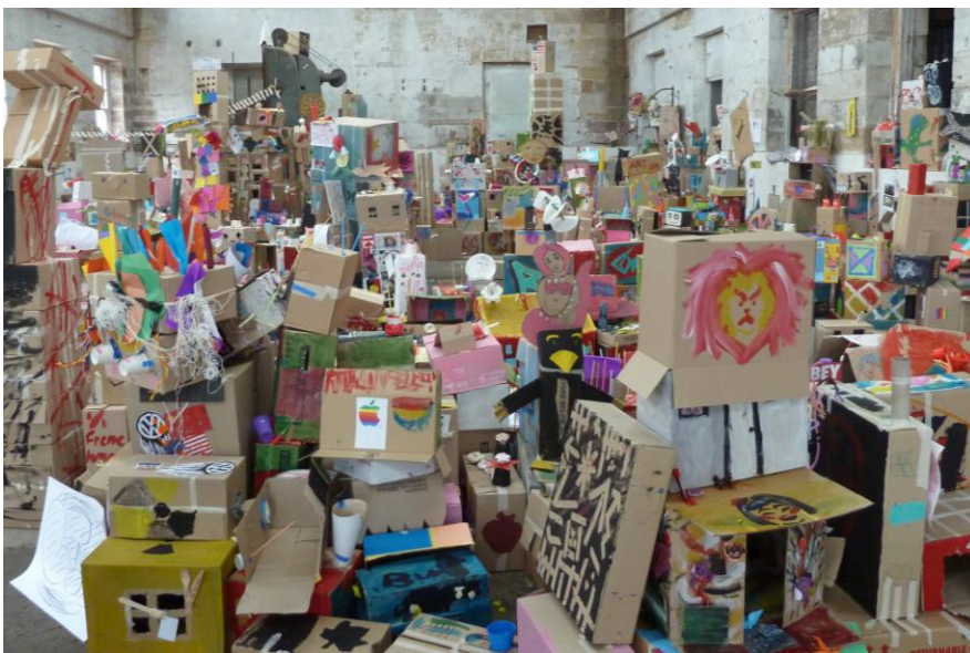
Streetscapes Art City at Outpost on Cockatoo Island 2011

They can be used as a means of communicating proposed solutions, highlighting special features, materials and colours. Most importantly, a model is informative and brings a building, object or place to life off the plan.