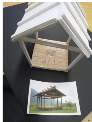
simple model of a hut using foamboard, toothpicks and PVA

Foamboard is used by designers and architects for model making and presenting work. It's easy to cut, light weight and gives a crisp, professional finish to a model. Purchased from any good art supply store, it consists of a central core of foam with thin card applied to either side. Foamboard comes in a variety of thicknesses with 5 mm being the most common. Foamboard is cut using a metal ruler and a blade and available in sizes A4 to A1.