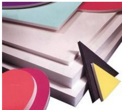
black, white and coloured foamboard